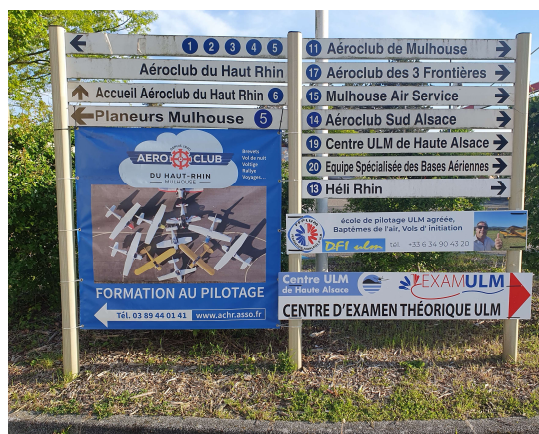
Habsheim, home of many entities