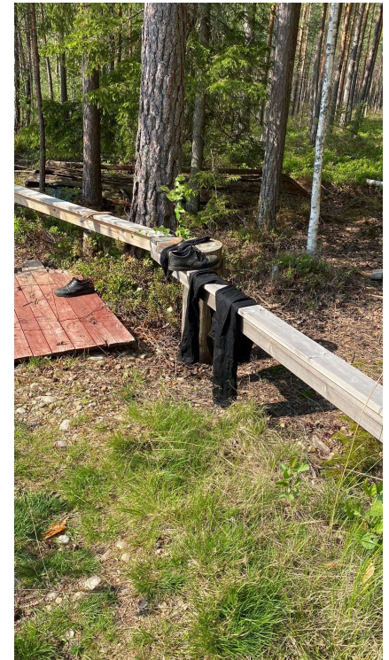
Flying with seaplanes can be wet business....

https://www.easa.europa.eu/en/document-library/product-certification-consultations/proposed-special-condition-usage-aeroplanes