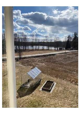
Not as green as in southern Europe but the ice has gone two days ago

20220430&utm_term=pro&mtm_source=notifications&mtm_medium=email&utm_content=title&mtm_pla cement=content&mtm_group=easa_news